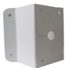
DS-1276ZJ-SUS Corner Mount