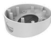
DS-1281ZJ-DM23 Inclined Ceiling Mount