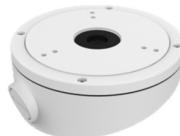
DS-1281ZJ-M Inclined Base Mounting Bracket