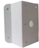
DS-1276ZJ Corner Mounting Bracket