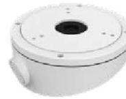
DS-1281ZJ-S Inclined Base Mounting Bracket