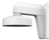
DS-1272ZJ-110-TRS Wall Mounting Bracket