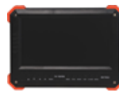
X41T Camera Tester