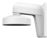
DS-1272ZJ-110-TRS Wall Mounting Bracket